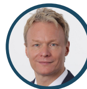
– CTO of Ariel Partners

These training classes are for senior management and team members within all departments who wish to improve the speed and effectiveness of decision making across the enterprise. Find out more about this exciting new approach to achieve real organizational agility - Flight Levels